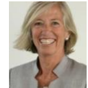
Ms. Stefania Giannini, Assistant Director General - Education, UNESCO, Paris, France